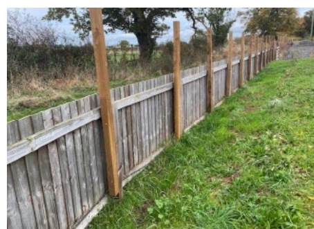
Track to the north