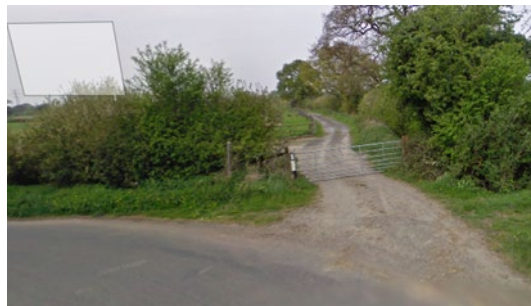
Existing track (off highway)